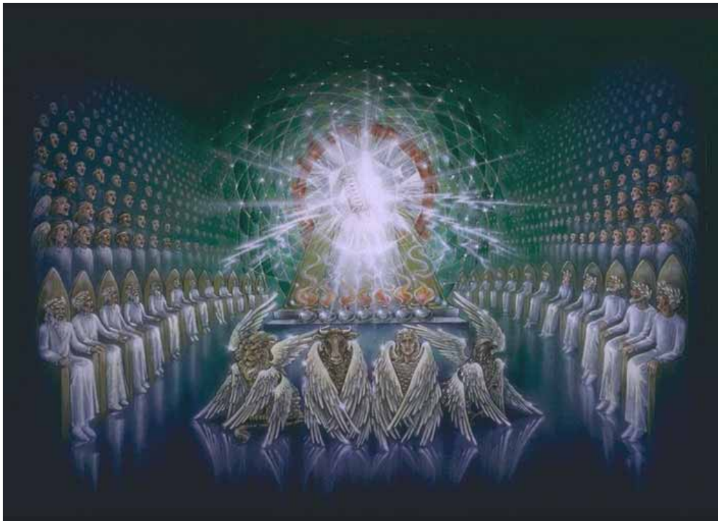
The Great White Throne Judgement